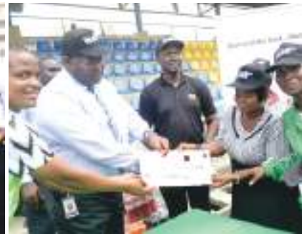
COVID-19 FOOD RELIEF FOR COMMUNITY & OTHER STAKEHOLDERS...DONATED BY 11PLC